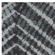
Mint 35327 LRV 17.9